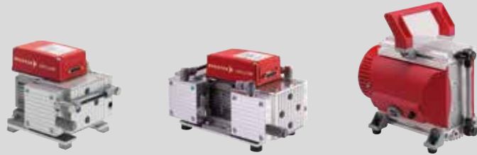
MVP 015-2 DC